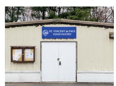
Thanks to an anonymous donor, we have a brand new sign for the Food Pantry!